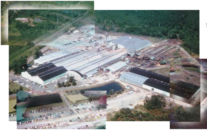
Savannah River, Georgia

HARMON IS A LEADER IN MARKETING ALL GRADES OF RECOVERED FIBER, JOB LOT, AND SECONDARY ROLLS INCLUDING: